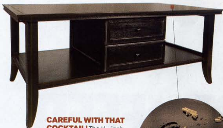
Pottery Barn Zoe Coffee Table $399

CAREFUL WITH THAT COCKTAIL! The 1/40-inch veneers (about as thick as a paper towel) will be difficult to refinish if they get scratched. Pottery Barn says it's upgrading its veneers.